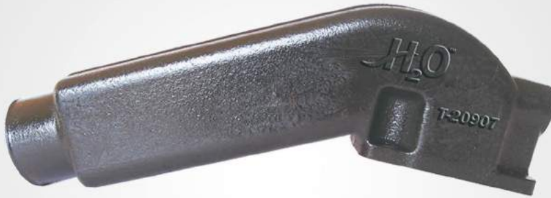
T-20907 Riser 3" outlet, 30° down angle