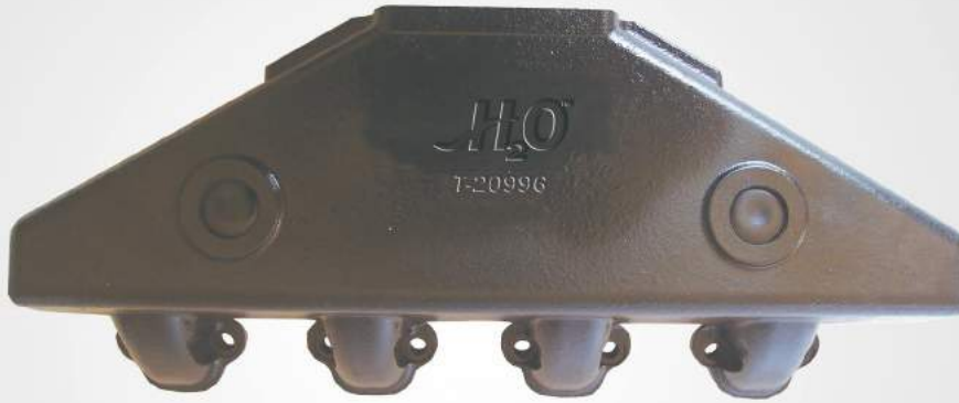
T-20996 Manifold, fits both side of engine.