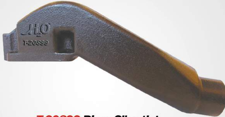
T-20899 Riser, 3" outlet