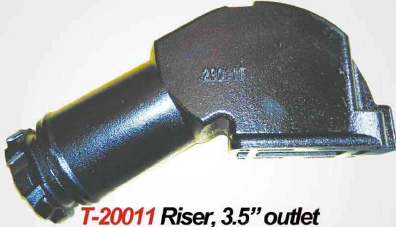
T-20011 Riser, 3.5" outlet